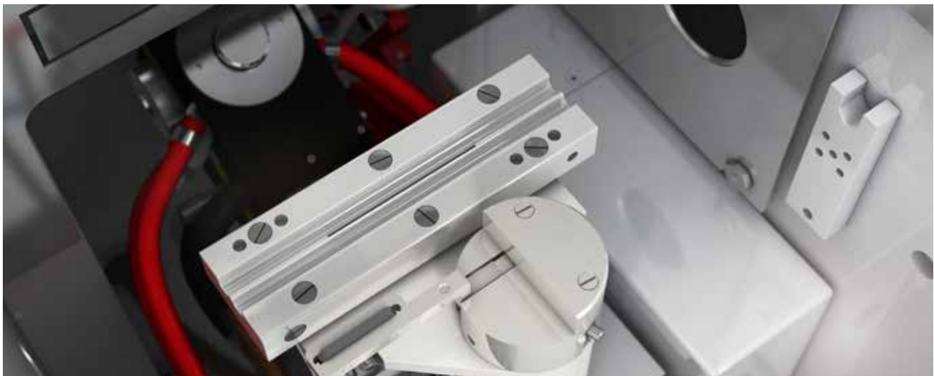
Burner head with Scraper and lowered graphite furnace (novAA 800 D)

The Scraper, an intelligent cleaning device for the burner head improves routines, especially when working with the acetylene-/nitrous oxide flame. It automatically cleans the slot before each measurement and in standby mode, thus guaranteeing a continuous and reproducible measuring cycle. It further contributes to lab safety and precision of results.