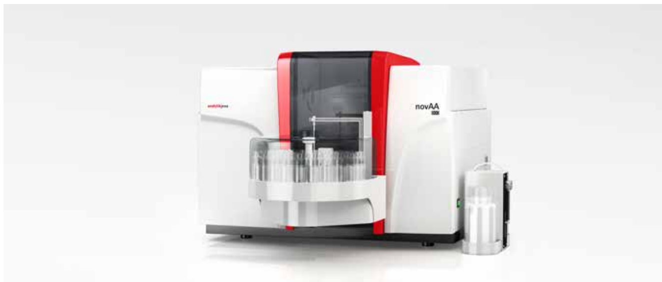
novAA 800 F with autosampler AS FD for flame technique