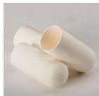
SX-040-A Cellulose Thimble 33x80 25 pcs

Select among our portfolio of standard extraction thimbles, compatible with all instruments on the market. Use our unique filters to increase efficiency of your Hydrolysis and Fiber methods.