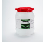
KT-240-A Titanium 3.71g Cu-TiO 2