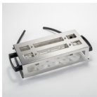
DI-030-A1/A2 Exhaust 10 or 20 position Digester