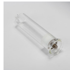
KD-022-A Burette Kit for quick exchange of Titrant solution