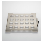
DI-052-A2 Washing Lid for 20 position Digester