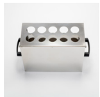
DI-001/002-A Tube Rack 10 or 20 position Digester

Increase your Kjeldahl Digestion efficiency with added accessories.