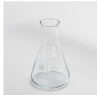
TU-220-A Conical Flask 250 ml 10 flasks