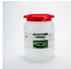
KT-260-A Wieninger 3.5g Se-Cu 2%