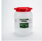
KT-211-A Missouri 3.5g Cu 0.3%