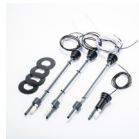
KD-020-A Flexible Tank Level Sensors 4 sensors