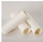
SX-041-A Cellulose Thimble 25x80 25 pcs