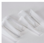
SX-050-A Crude Fiber Bags 25/17 25µm porosity 50 pcs