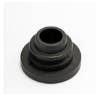
KD-025-A Tube Adapter for using 100 ml glass tubes in Analyzer