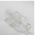
KD-030-A1 Glass Splash- head for Standard Analysis