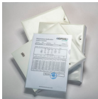
KD-002-A Recovery Test with delivery of unit