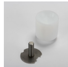
KD-023-A Büchi Adapter for using Büchi glass tubes in Analyzer