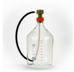
DI-111-A Water Trap for Liquid Digestion and Scrubber