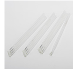
TU-222-A Boiling Rods 10 rods