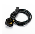
KD-001-A1 UK Power Cable