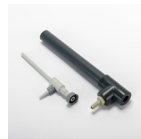
DI-054-A1/A2 Water Jet Pump for 10 or 20 position Digester