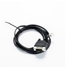
KD-024-A1/2/3 External Titrator Package 1 cable