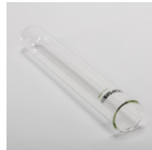
TU-214-A Tubes 250 ml 20 tubes