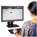
LA-020-A LabConnect LIMS software to increase efficiency

Configure your KjelROC system with additional accessories to lower risk for mistakes, increase precision and for added efficiency.