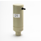
KD-030-A3 PP Splashhead for Analyzer and High Volume analysis