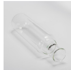
TU-223-A Tubes 450 ml 10 tubes