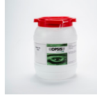
KT-230-A Universal Copper 5g Cu 9%