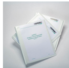
KD-026-A IQ/OQ/PQ Test Documents