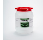
KT-250-A Selenium 3.5g Se 0.1%