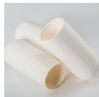
SX-044-A Cellulose Thimble 40x80 25 pcs