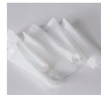
SX-043-A HydROC Filters 50 filters