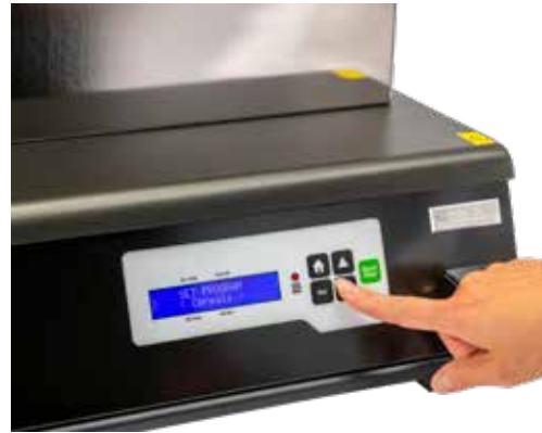
EASY PROGRAMMING FOR ALL LEVELS OF USERS