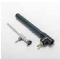
DI-054-A1, Water Jet Pump/Ejector 10 DI-054-A2, Water Jet Pump/Ejector 20