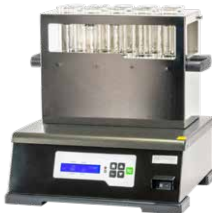
DI-220/221-C, KjelROC Digestor Auto 20

Our standard Digestion block with capacity for 10 or 20 tubes, one rack included and exhaust for DI-211/221-C