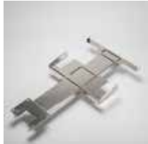
DI-050-A1, Fixed cooling stand 10 DI-050-A2, Fixed cooling stand 20 to mount on Digester Auto, for both Tube Rack and Exhaust

The KjelROC Digestion portfolio offers something for most labs