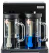
DI-110-A, KjelROC Scrubber