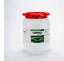
KT-200-Series Kjeldahl Tablets