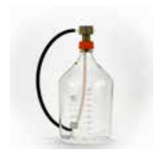
DI-111-A, Water Trap for Liquid Digestion