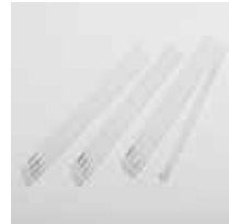
TU-222-A, Boiling Rods