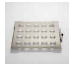
DI-052-A2, Washing Lid 20