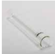
TU-214-A, 250 ml Tubes TU-223-A, 450 ml Tubes TU-221-A, 750 ml Tubes