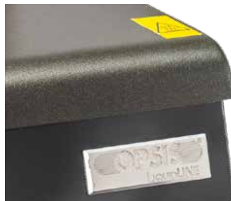
ALL KJELROC DIGESTORS HAVE THE OPSIS LIQUIDLINE BLACKLINE COATING AS WELL AS A PTFE PROTECTION ON THE TOP COVER

** OPSIS LiquidLINE BlackLINE coating is taken from latest development in Swedish corrosion technology. Similar coating is used in trucks and cars from Volvo and Scania.