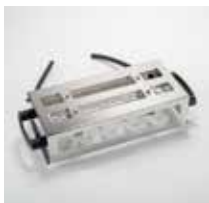
DI-030-A1, Exhaust 10 DI-030-A2, Exhaust 20