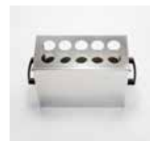
DI-010-A, Rack 10 DI-020-A, Rack 20