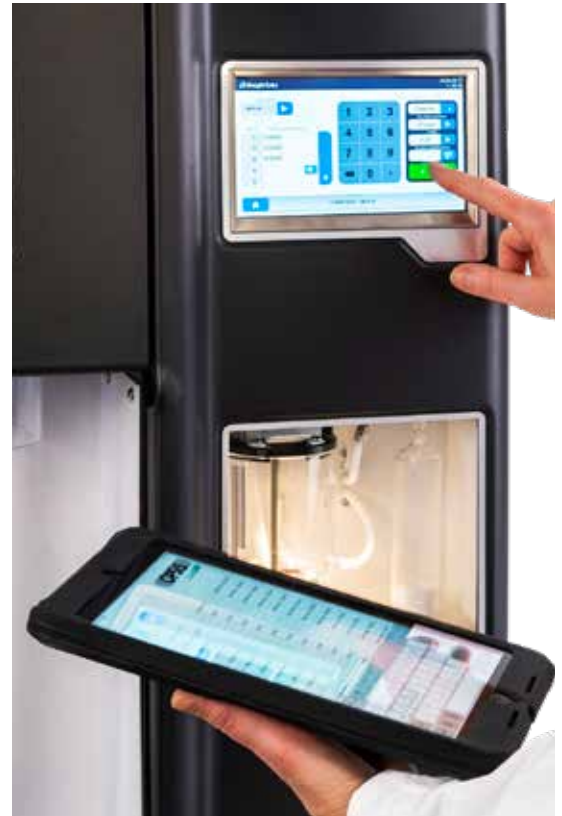
THE LABCONNECT SOFTWARE ALLOWS FOR EASY CONNECTIVITY TO YOUR LABORATORY