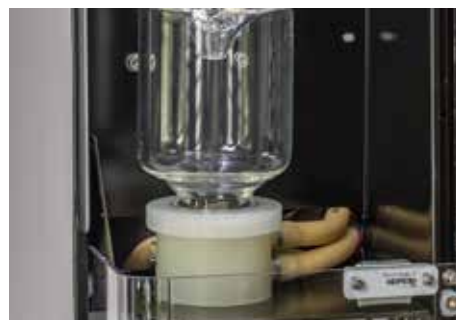
PROTECTION WITH BLACKLINE AS WELL AS PTFE COATING AROUND SENSITIVE PARTS. POLYPROPYLENE SPLASHHEAD OPTIONAL.

** OPSIS LiquidLINE BlackLINE coating is taken from latest development in Swedish corrosion technology. Similar coating is used in trucks and cars from Volvo and Scania.