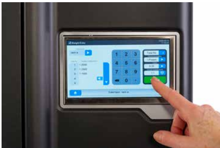
AN OVERVIEW OF THE WHOLE RACK WITHOUT POP-UP DIALOGUES - AN INSTRUMENT WITH THE USER IN MIND.