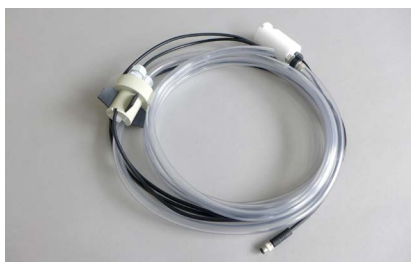
Tank level control 1005098