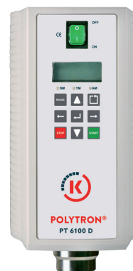
PT 6100 D