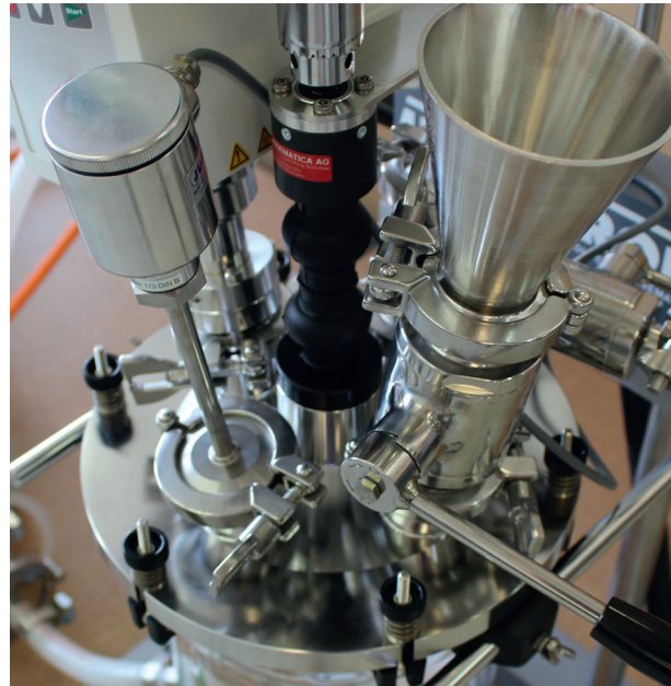
Tri clamp connectors and dosage funnel on the lid