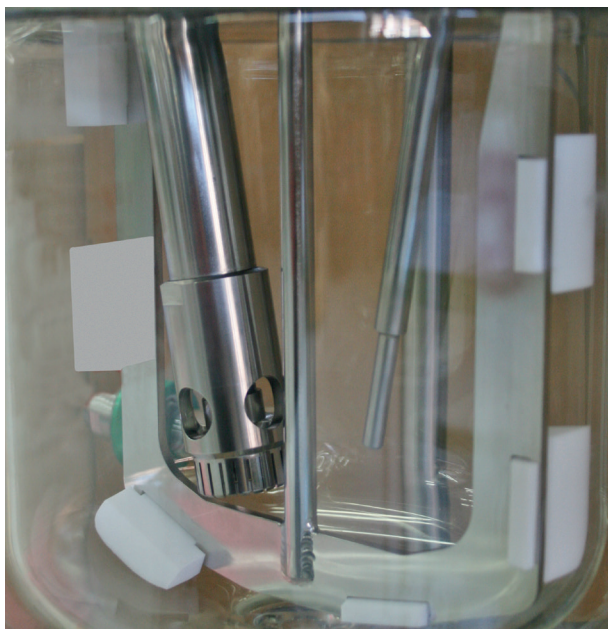
Dispersing aggregates, PTFE anchor stirrer and temperature probe