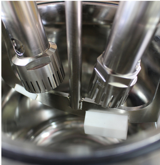
Design with two special dispersing aggregates

In REACTRON® systems, the stirrer guarantee macro-mixing of the product in the reactor vessel. In laboratories, we use a digital laboratory stirrer with a high revolution speed, permanent torque. LCD revolution indicator, plus overload and overheating protection.