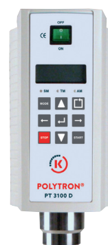
PT 3100 D