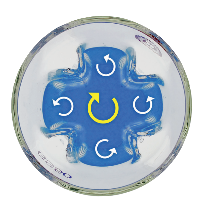
GS vessel principle (viewed from above)

Our GS-glasses are available in chemical- and temperature-resistant borosilicate glass or in stainless steel, with working volumes from a few milliliters to several liters, with or without lid and with or without sealed feedthrough.