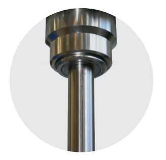
Step 1 Step 2 Step 3