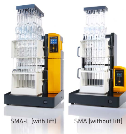
SMA-L (with lift)

2) 230 V version, special voltages on request