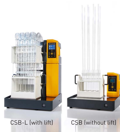
CSB-L (with lift)

2) 230 V version, special voltages on request